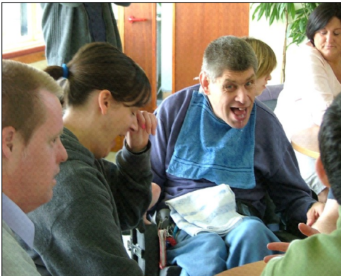
At a Community Forum in the West of Scotland